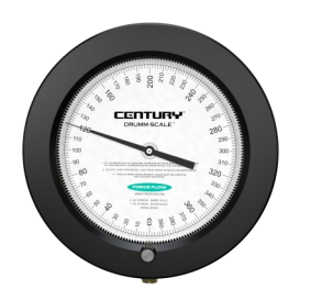
Century™ Dial No AC/DC power required, explosion-proof scale

problems other sensor technologies face caused by irregular tank shapes, corrosive chemical fumes, fluctuating temperatures and changes in specific gravity.