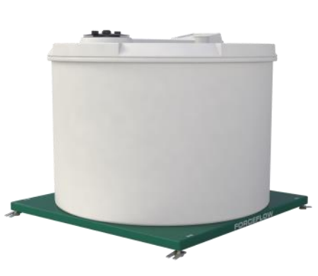
High Accuracy 4-Load Cell Model