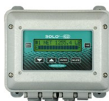
SOLO®G2 (1 OR 2 CHANNEL) Bulletin 516

The Hi-Accuracy Carboy-Scale can be ordered as a complete weighing system including a SOLO G2® or Wizard 4000® Digital Weight Indicator or as just the scale platform, to be combined with other scales or ultrasonic sensors monitored from a multi-channel weight indicator.