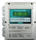
WIZARD 4000® (1 TO 4 CHANNEL) Bulletin 400